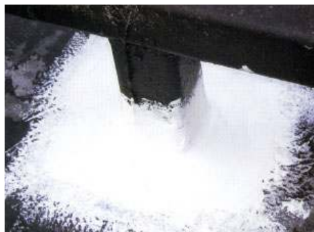
Application of Membrane