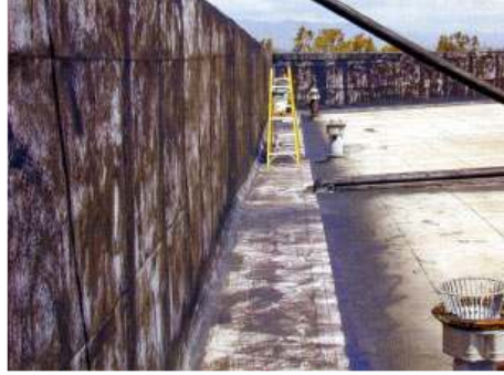
Walls & Drains - Before & After