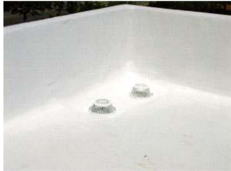
Reflective Surface Coating is Applied

Elastahyde elastomeric roof coating or Silverwhite system.