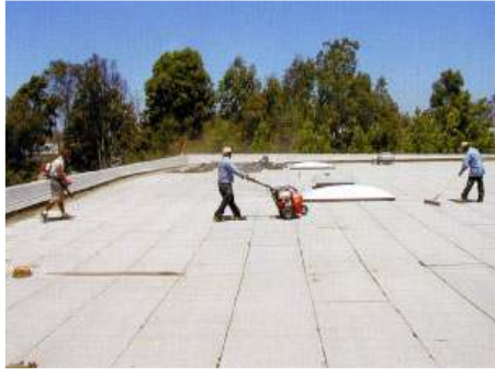
Clean & Prep existing roof