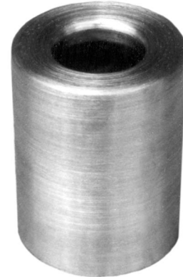
Counter Flashing for Vent Pipe

Suggested Specification Statement: Provide FlashCo L-Series lead flashing with counter flashing for each round roof penetration. Include stainless steel hose clamp and appropriate caulking sealant for each non-vent penetration. Flashing shall be installed in accordance with the recommendations and specifications of the roofing material manufacturer.