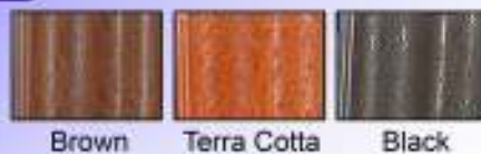
Brown Terra Cotta Black

Any color can be custom-blended by our RPM Color Master System