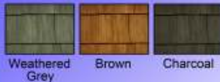
Weathered Grey Brown Charcoal