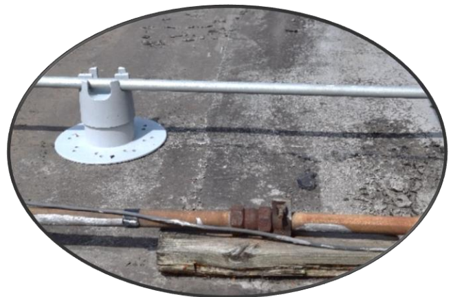
The difference between using wood blocks and Lite Pipe KnuckleHead Assembly. KnuckleHead replaces wood supports.

Using Lite Pipe KnuckleHead Assembly will keep your pipes, conduit, walkways and equipment high, safe and dry. Our supports will never rot or deteriorate because of their tough molded nylon composition.