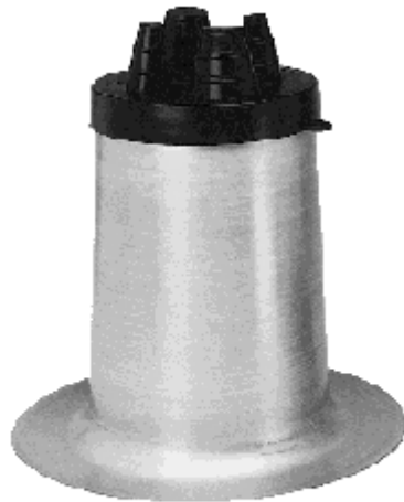
Extra Tall Alumi-Flash