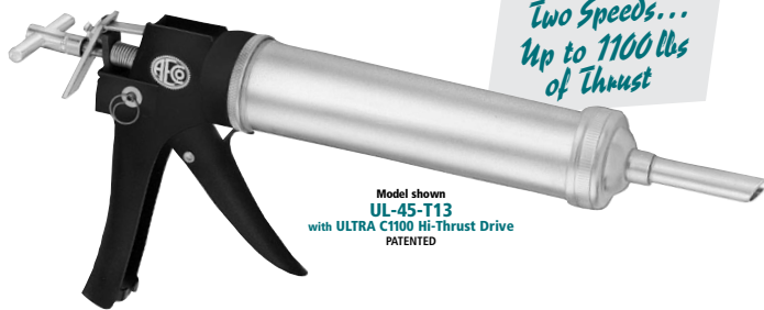
Model shown UL-45-T13 with ULTRA C1100 Hi-Thrust Drive PATENTED