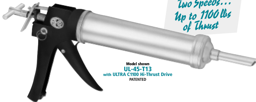
Model shown UL-45-T13 with ULTRA C1100 Hi-Thrust Drive PATENTED