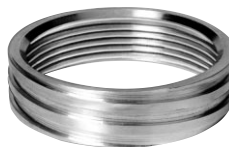
811-1 Thread Adaptor Allows Albion Models with 2" threads to be used with Cox style 2" threaded caps and accessories.