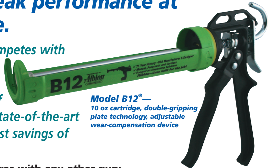
Model B12® — 10 oz cartridge, double-gripping plate technology, adjustable wear-compensation device

The re-designed "B" Line competes with the best European and Asian imports and surpasses them with the integration of Albion's legendary quality, state-of-the-art engineering and with the cost savings of an import!