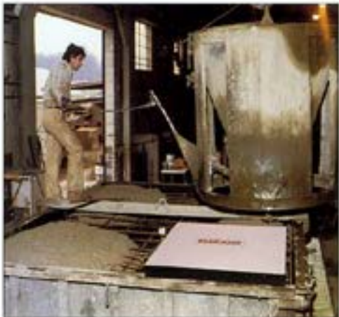
Bilco doors feature a covering for protection during the pouring process.