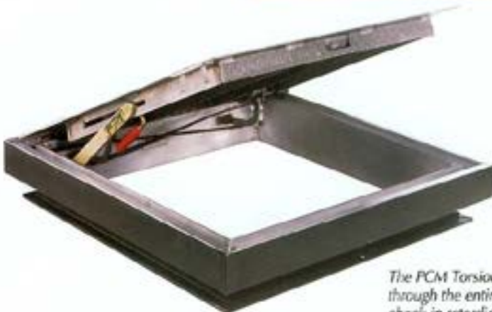
The PCM Torsion/Cam design provides ease of operation through the entire arc of opening, and for safety acts as a check in retarding downward motion of the door.