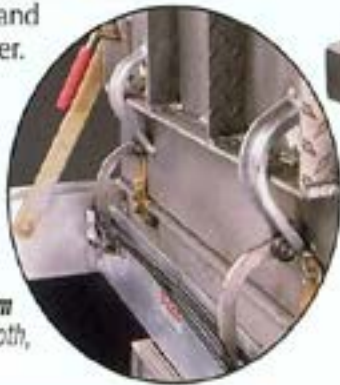
New Torsion/Cam System for smooth, easy operation.

Quick, hassle free installation. Long service life. Smooth, easy operation. An unbeatable combination for both you and your customer.