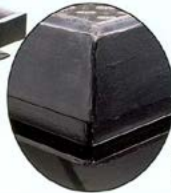
Frame depth designed to match slab thickness

As a precaster, you are concerned with installation time. You're also concerned with giving your customers the smooth, easy operation a Bilco door provides. The new PCM does both. Installation is easier than 1, 2, 3. Just forget 2 and 3. Put the door in place on the form and make your pour. No fuss. No bother. No special forming required. The PCM frame provides the form for you.