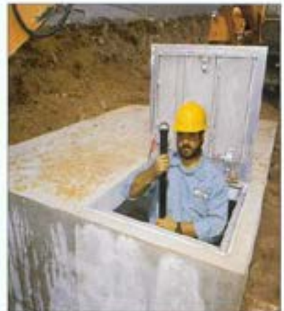
PCM door shown with Bilco LadderUP Safety Post for easier, safer ladder use.