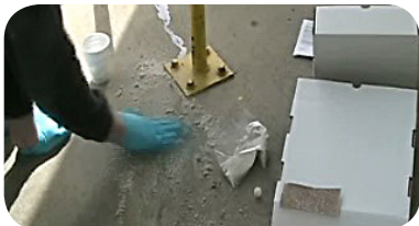
STEP 2: Remove Excess Material