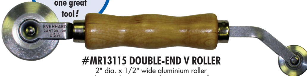
#MR13115 DOUBLE-END V ROLLER 2" dia. x 1/2" wide aluminium roller with a 1-1/8" x .196" aluminium "V" roller

We combined the MR13500 and the MR13110 into one great tool!