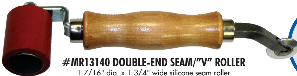
#MR13140 DOUBLE-END SEAM/"V" ROLLER 1-7/16" dia. x 1-3/4" wide silicone seam roller with a 1-1/8" x .196" aluminium "V" roller

We combined the MR05020 and the MR13110 into one great tool!