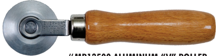
#MR13500 ALUMINUM "V" ROLLER 2" dia. x 1/2" wide aluminum roller tapered to a 5/64" radius, with straight double fork