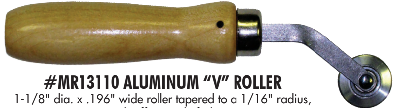
#MR13110 ALUMINUM "V" ROLLER 1-1/8" dia. x .196" wide roller tapered to a 1/16" radius, with offset single fork

We combined the MR13500 and the MR13110 into one great tool!