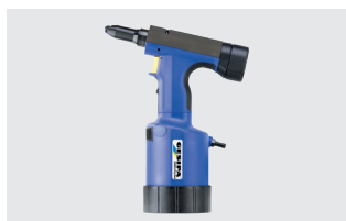
TAURUS 2 Peel Rivet Pneumatic-hydraulic setting Material No.: 1492956