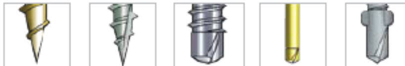
Sharp Point Type 17 Point Drill Point Pilot Point Drill Point w/ Wings