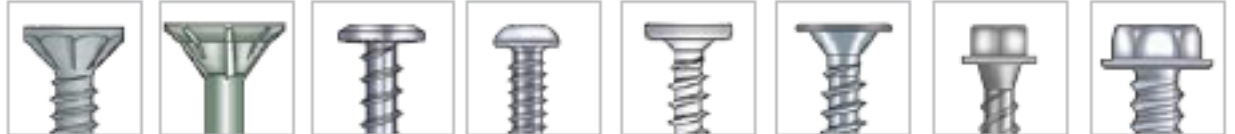
Ribbed Flat Head Ribbed Wafer Head Modified Truss Head Pan Head Pancake Head Ultra Low Profile Pancake Head 1/4" Hex Washer Head 5/16" Hex Washer Head

Shank smooth shank and fully threaded screws are available