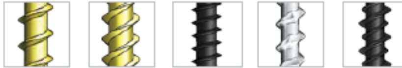
Coarse Threads Twin Threads Fine Threads Box Threads Hi-Lo Threads