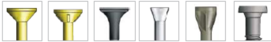
Flat Head Flat Head w/ nibs Bugle Head Trim Head Trim Head w/ nibs Cap Head

Shank smooth shank and fully threaded screws are available