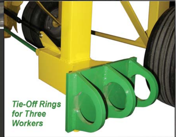
Tie-Off Rings for Three Workers

* With the optional Fall Restraint Tie-Off Rings™ , the TriRex accommodates a total of five workers.