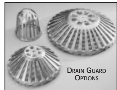
DRAIN GUARD OPTIONS

Distributed by: BEST MATERIALS LLC 602-272-8128 800-474-7570 www.bestmaterials.com