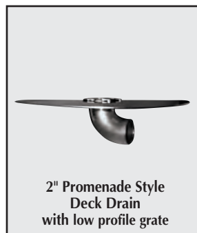
2" Promenade Style Deck Drain with low profile grate