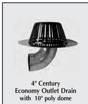
4" Century Economy Outlet Drain with 10" poly dome