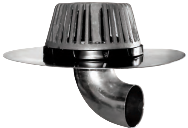
ABOVE: 4" Century Outlet Drain with clamping ring & cast iron dome