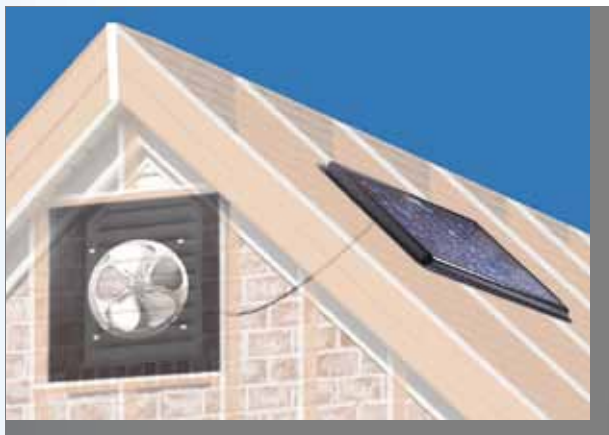
Model Shown: GBL 850