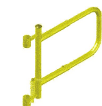
SHG Steel Gate Option