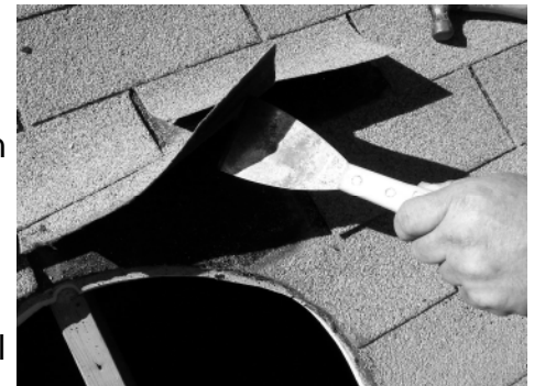
Fig. 3 - Lifting the Shingles

Step 7 - Lifting the Shingles: The shingles located directly above and to the sides of the attic hole must be lifted from the nails or staples holding them in place. This can be accomplished by inserting the reciprocating saw sideways, in between the shingles and the roof decking, at the 9 o'clock position of the attic hole. Then, in a sweeping motion cutting from the left-hand side of the hole to the right-hand side, use the saw to cut through the roofing nails until you reach the 3 o'clock position of the hole. Alternatively, any flat bladed tool (i.e. such as a trial) can be used to pry up the roofing nails as needed (see Fig. 3).