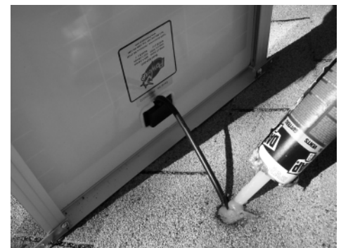
Fig. 4 - Mounting the Solar Panel

Step 8 - Mounting the Solar Panel: If installing Attic Breeze models AB-201A/202A/251A/252A, skip ahead to Step 10. Depending on the mounting bracket option you have chosen for your remotely mounted solar panel, you will need to either drill a hole in your roof or attic wall to accommodate the solar panel wire. Using a power drill equipped with a ½ inch bit, drill a hole in the roof centered over the area chosen for your solar panel or in the attic wall near your adjustable bracket. Insert the solar panel wiring through the hole and into the attic. Using the caulking gun, seal around the hole and wire (see Fig. 4). Install the solar panel as directed by the instructions included with your specific mounting bracket kit.