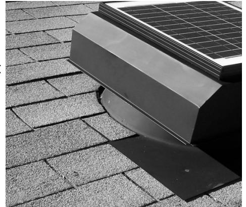
Fig. 5 - Installing the Attic Vent

Step 10 - Installing the Attic Vent: Using the roofing knife, cut a 4 inch gap in the shingles and tar paper at the 3 o'clock and 9 o'clock positions of the attic hole to allow the attic vent flashing to slide underneath. Position the attic vent unit so that it is horizontally centered with the attic hole. Slide the square flashing of the attic vent unit, underneath the shingles and tar paper, into the gap that was cut at the 3 o'clock and 9 o'clock positions of the hole. Lift the unit up at an angle while still in position. Using the caulking gun, run a bead of caulk on the bottom side of the flashing facing the roof. When finished, continue sliding the unit upward and underneath the shingles until it is positioned directly over the attic hole. The cylindrical part of the attic vent should be touching the cut out edge of the shingles when the unit is aligned directly above the hole (see Fig. 5).