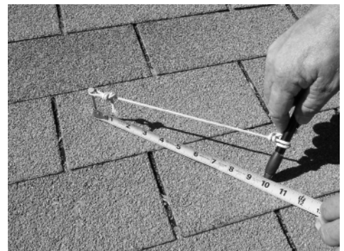
Fig. 1 - Marking the Attic Hole

Step 5 - Marking the Attic Hole: Hammer a nail part-way into the roof in the approximate center of the area chosen to install the attic vent. Tie one end of string to a permanent marker, and the other end to the nail. The knot tied to the nail should allow the string to move freely in a circle around the nail (i.e. no winding of the string around the nail). Adjust the length of the string so that when the marker is pulled tight on the string, it measures 10 inches from the nail (see Fig. 1). Keeping tension on the string with the marker, trace out a circle onto the roof. The resulting circle will have a diameter of 20 inches.